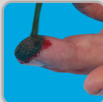
Finger wound treated with WoundSeal powder